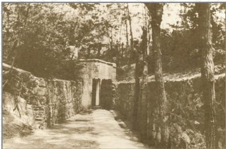
Ancient "Hedgehog Well"