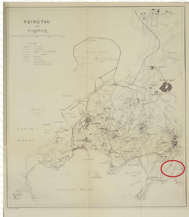
1900-1901 "Map of Qingdao and its Surrounding Areas" Clearly mark the location of the mineral water plant